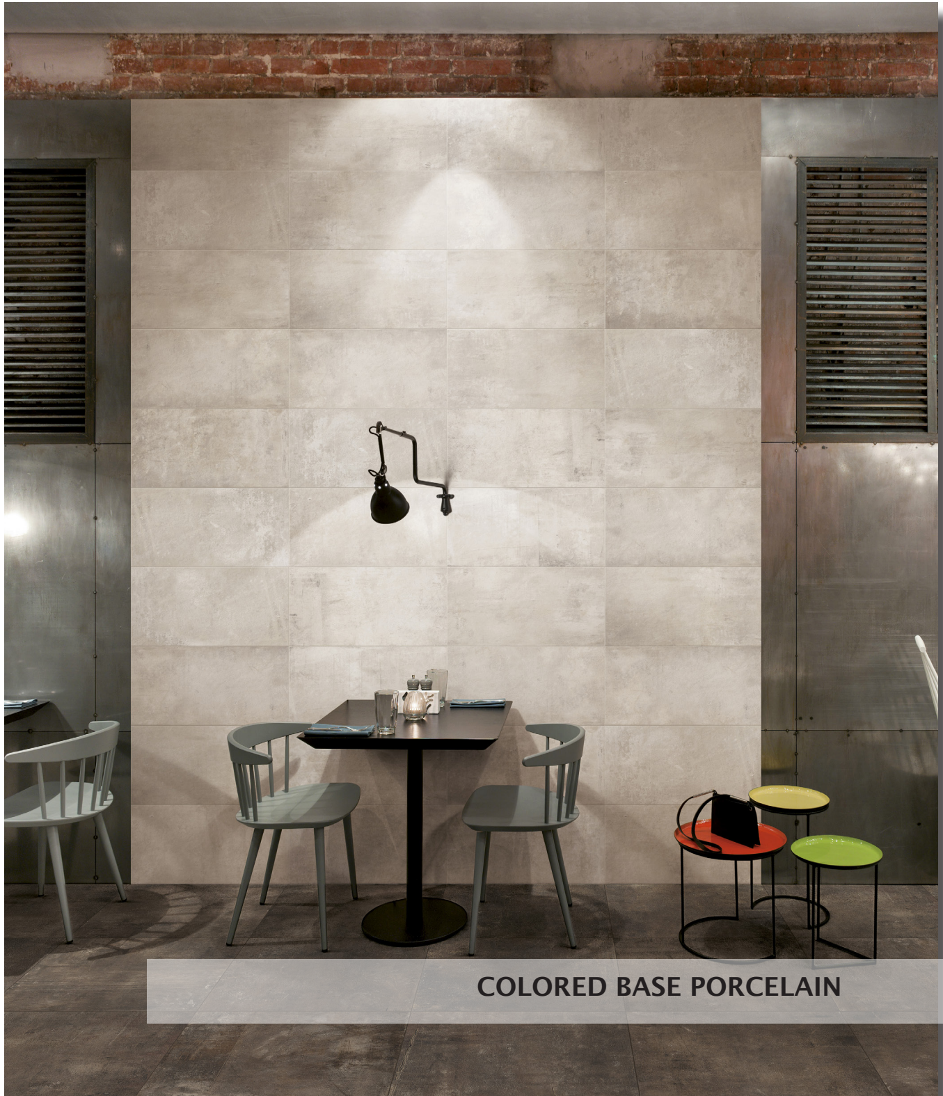
COLORED BASE PORCELAIN

A cement look porcelain typically used for urban areas and industrial redevelopment, Plant provides a contemporary look for any modern day setting.