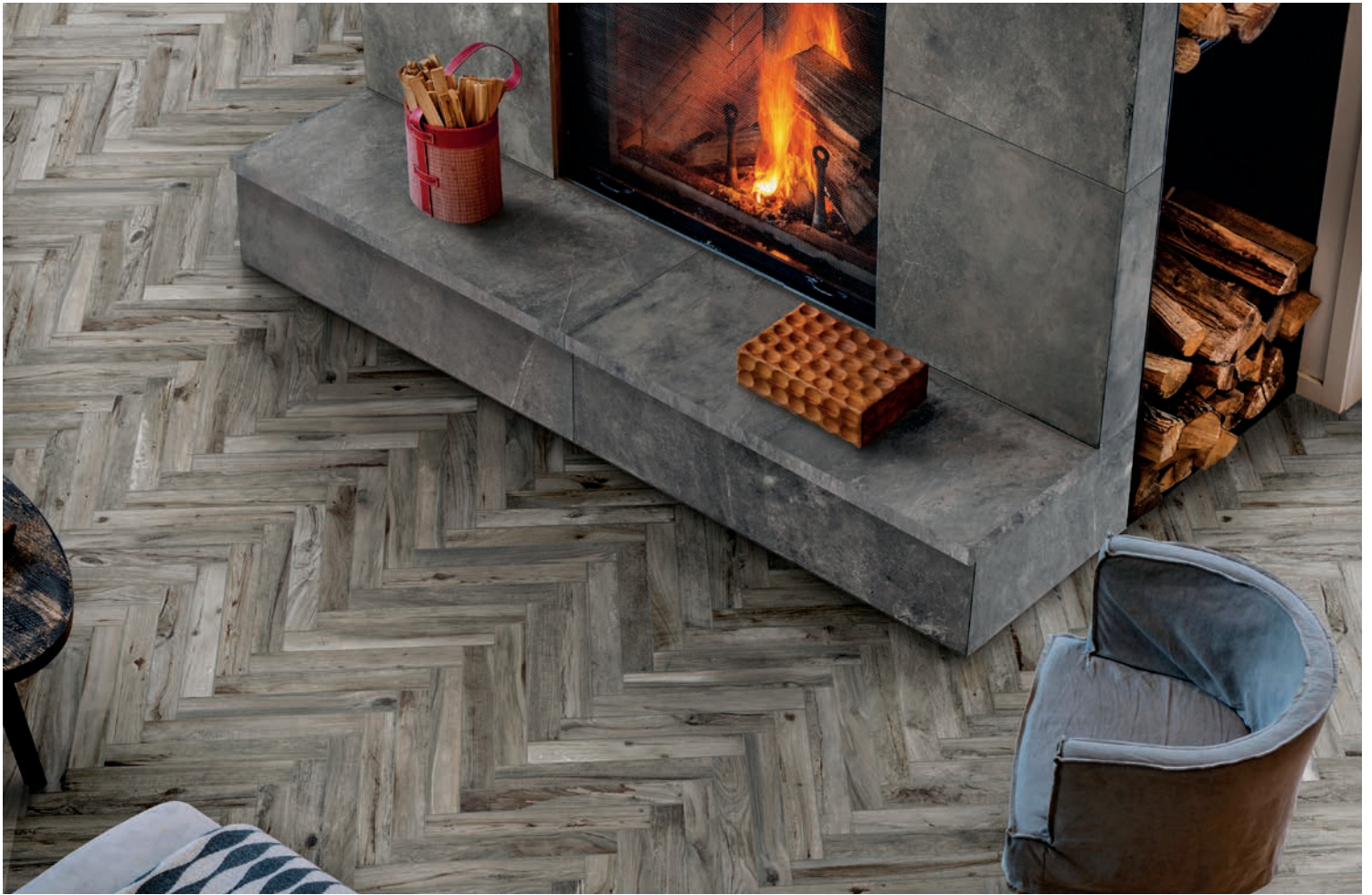
TORTORA (Warm Grey)