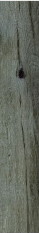
7.5 x 45 cm (3 x 18) RD.LV.CNR.0318