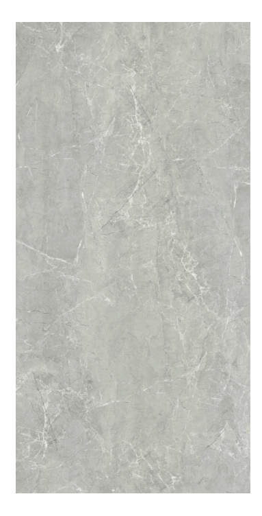
GREY IMPERIAL 30 x 60 cm (12" x 24") 5mm thickness SPC with underpad HV.CT.GIM.1224.PAD