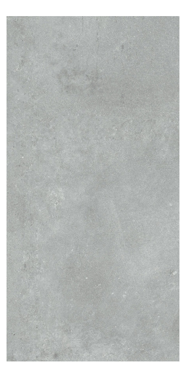
SMOKE GREY 30 x 60 cm (12" x 24") 5mm thickness SPC with underpad HV.CT.SMK.1224.PAD