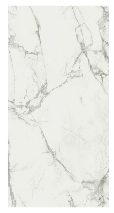
STATUARIO 30 x 60 cm (12" x 24") 5mm thickness SPC with underpad