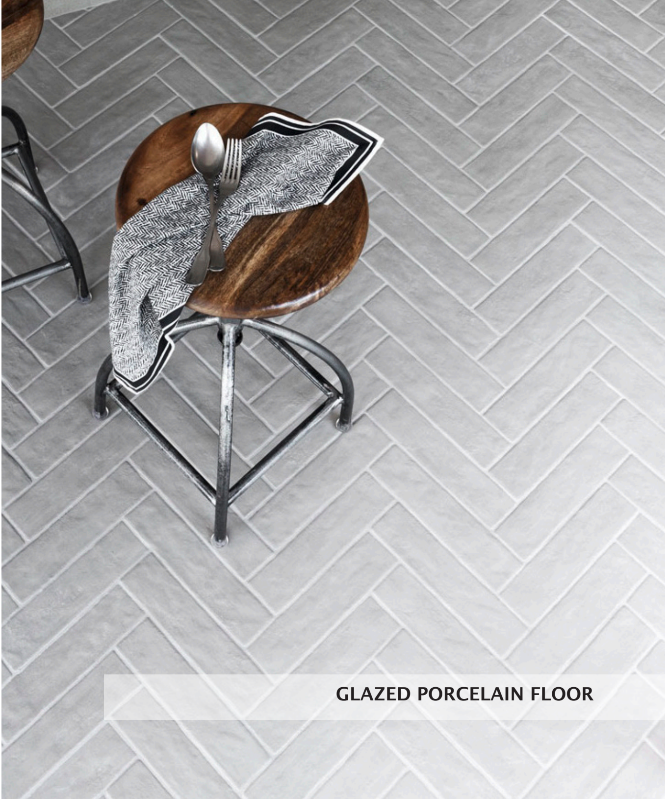
GLAZED PORCELAIN FLOOR

The beauty of exposed brick with a refreshed modern look. Versatile and contemporary palette gives a wash of modernity over a classic, handmade replica of brick.