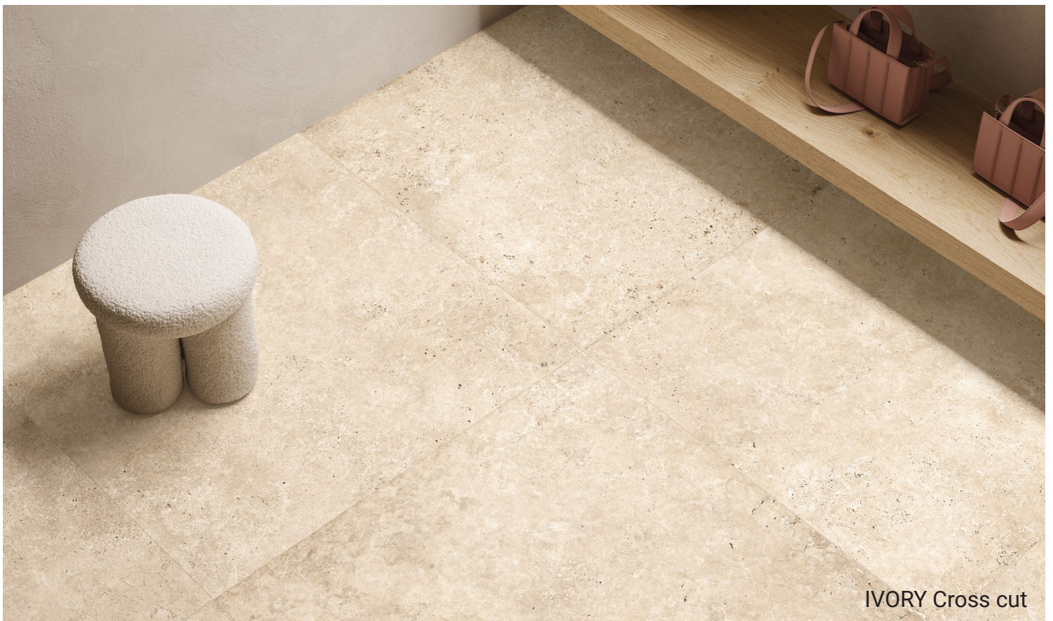
IVORY Cross cut