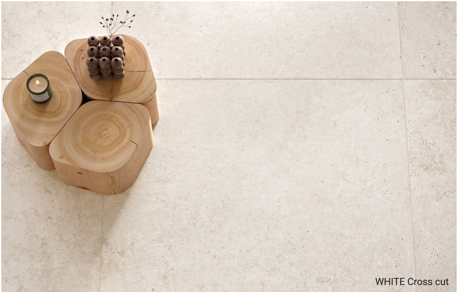
WHITE Cross cut