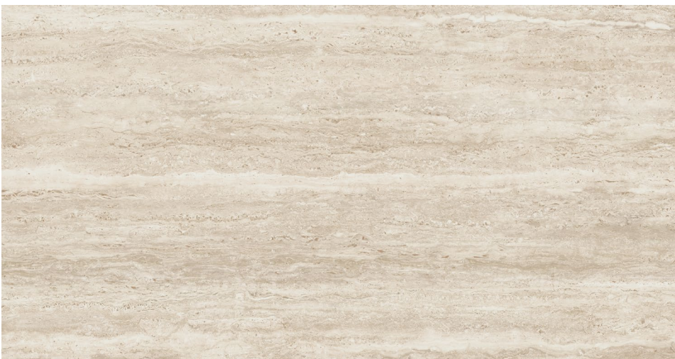
SAND (Vein cut) 60 x 120 cm (24" x 48") Matte Finish UE.AS.SND.2448.MT.VC

All items shown in this document are part of Olympia's stocking program. For special orders, please contact your Olympia Tile Sales Representative.