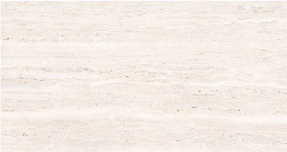
WHITE (Vein cut) 60 x 120 cm (24" x 48") Matte Finish UE.AS.WHT.2448.MT.VC