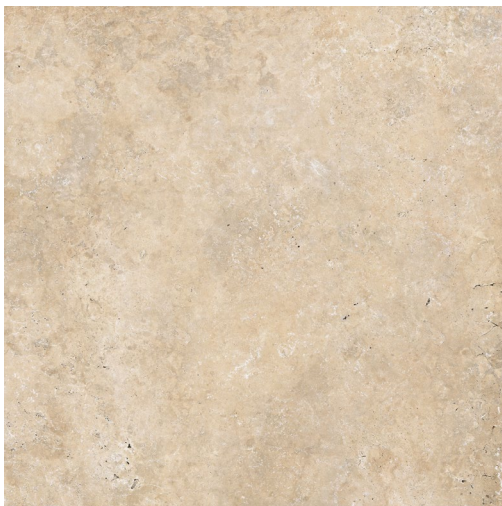
BEIGE (Cross cut) 60 x 60 cm (24" x 24") Matte Finish UE.AS.BGE.2424.MT.CC

All items shown in this document are part of Olympia's stocking program. For special orders, please contact your Olympia Tile Sales Representative.