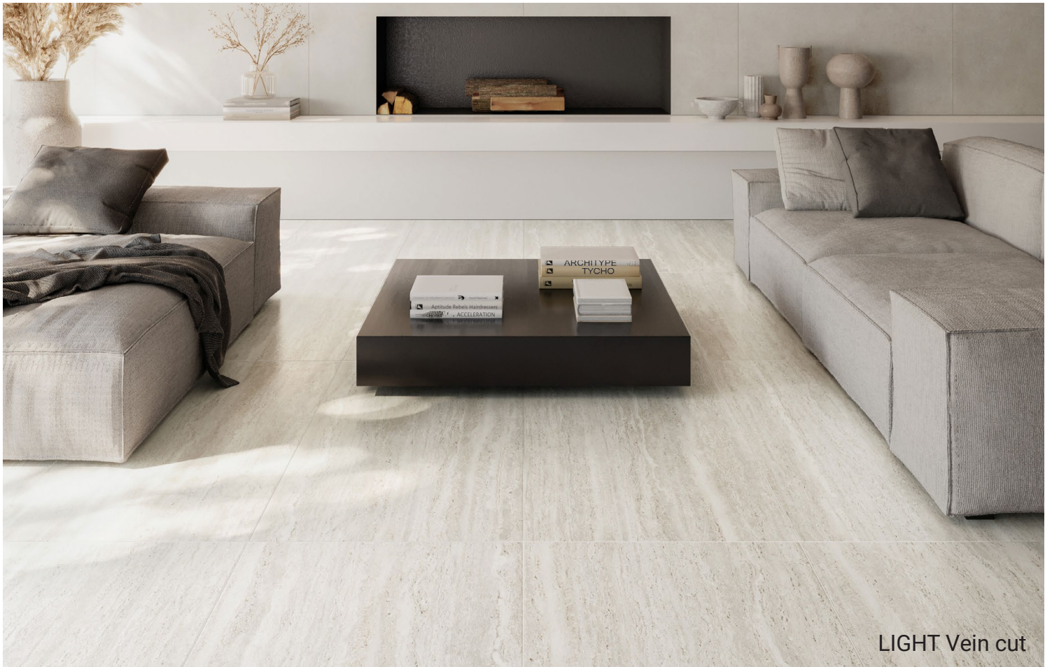
LIGHT Vein cut