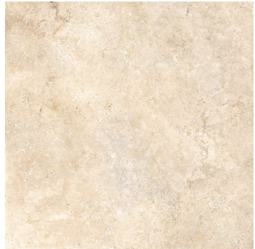
IVORY (Cross cut) 60 x 60 cm (24" x 24") Matte Finish UE.AS.IVO.2424.MT.CC