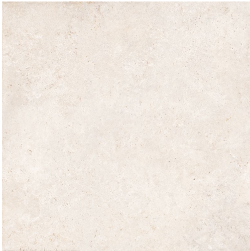
WHITE (Cross cut) 60 x 60 cm (24" x 24") Matte Finish UE.AS.WHT.2424.MT.CC