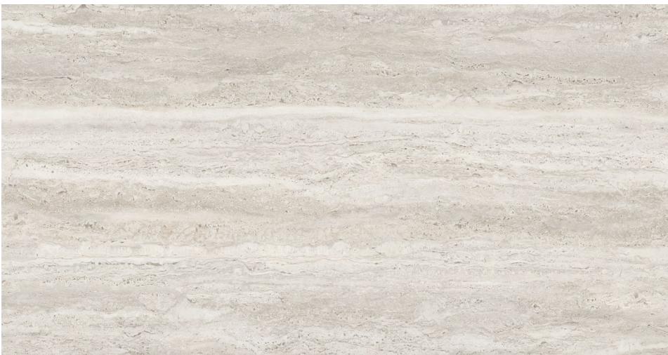
LIGHT (Vein cut) 60 x 120 cm (24" x 48") Matte Finish UE.AS.LHT.2448.MT.VC