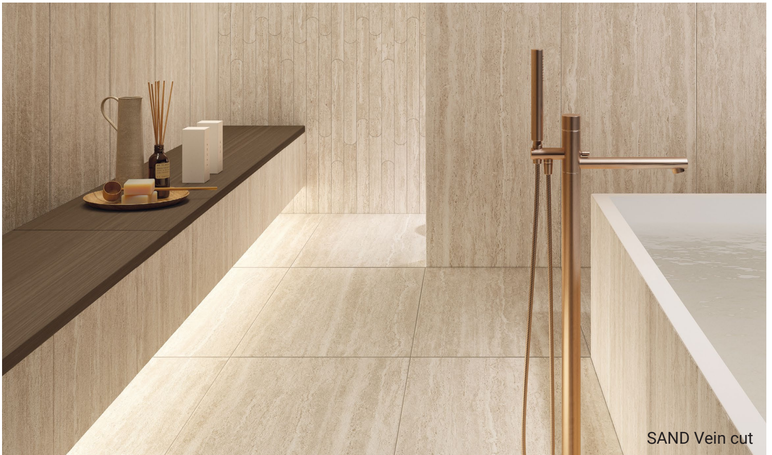
SAND Vein cut