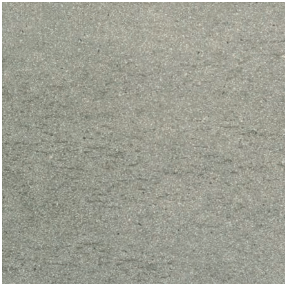
60 x 60 cm (24 x 24) MZ.SH.GRY.2424