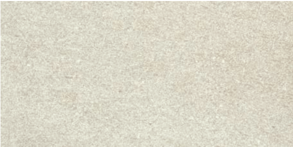
30 x 60 cm (12 x 24) MZ.SH.BGE.1224