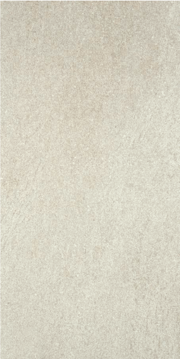
60 x 120 cm (24 x 48) MZ.SH.BGE.2448