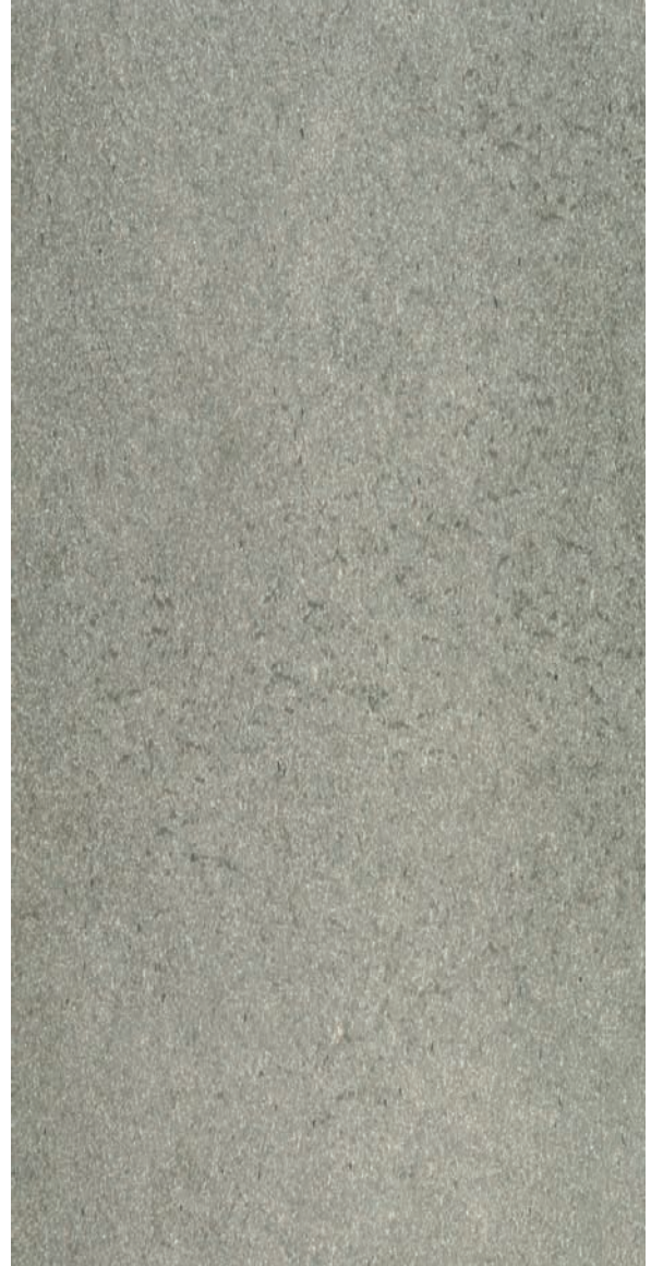
60 x 120 cm (24 x 48) MZ.SH.GRY.2448

All items shown in this document are part of Olympia's stocking program. For special orders, please contact your Olympia Tile Sales Representative.