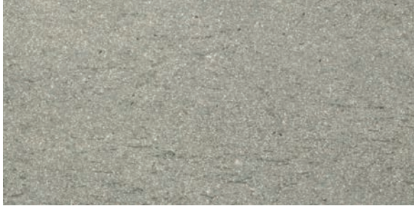
30 x 60 cm (12 x 24) MZ.SH.GRY.1224