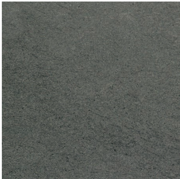
60 x 60 cm (24 x 24) MZ.SH.ANT.2424