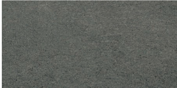
30 x 60 cm (12 x 24) MZ.SH.ANT.2424