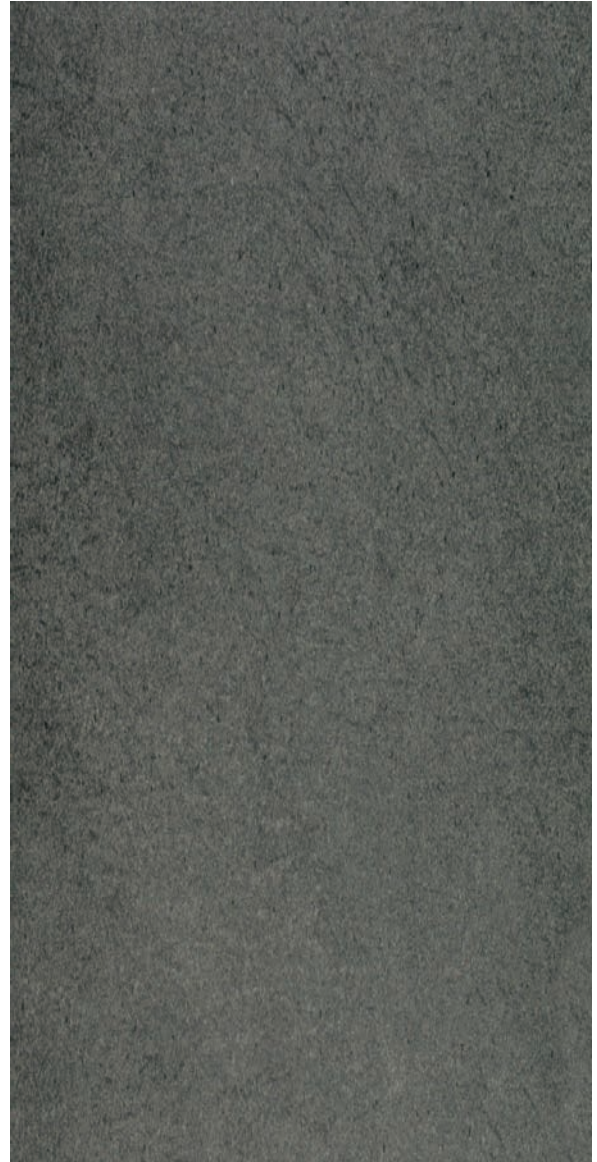
60 x 120 cm (24 x 48) MZ.SH.ANT.2424

All items shown in this document are part of Olympia's stocking program. For special orders, please contact your Olympia Tile Sales Representative.