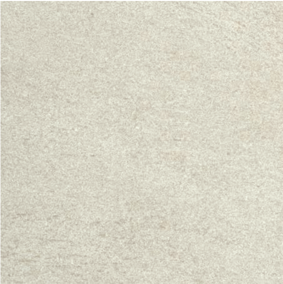
60 x 60 cm (24 x 24) MZ.SH.BGE.2424

All items shown in this document are part of Olympia's stocking program. For special orders, please contact your Olympia Tile Sales Representative.