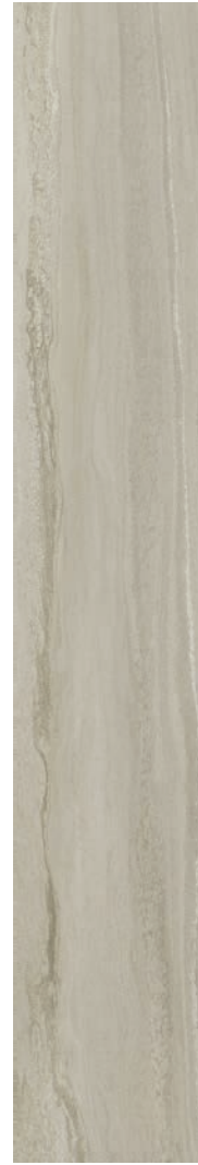
20 x 120 cm (8 x 48) Matte Finish OV.SH.GRY.0848.MT.OS