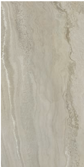
30 x 60 cm (12 x 24) Matte Finish OV.SH.GRY.1224.MT