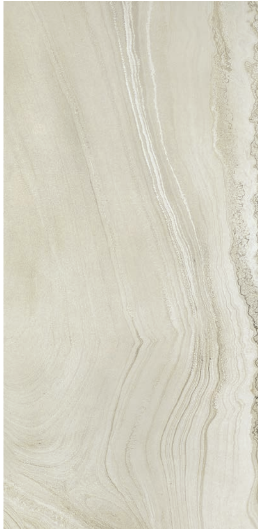
60 x 120 cm (24 x 48) Matte Finish OV.SH.WHT.2448.MT