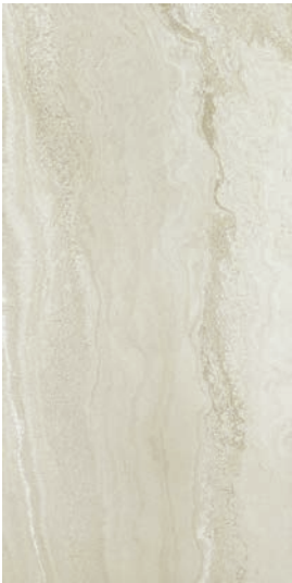
30 x 60 cm (12 x 24) Matte Finish OV.SH.WHT.1224.MT