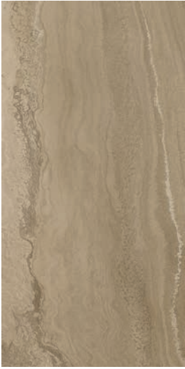
30 x 60 cm (12 x 24) Matte Finish OV.SH.TPE.1224.MT