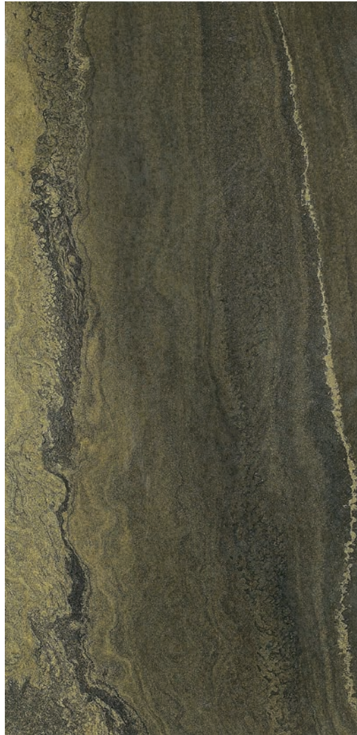
60 x 120 cm (24 x 48) Matte Finish OV.SH.BWN.2448.MT