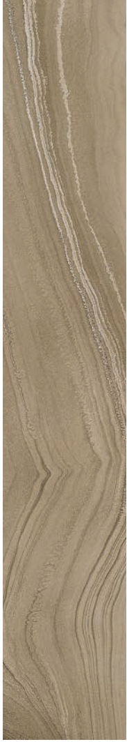
20 x 120 cm (8 x 48) Matte Finish OV.SH.TPE.0848.MT.OS

All items shown in this document are part of Olympia's stocking program. For special orders, please contact your Olympia Tile Sales Representative.