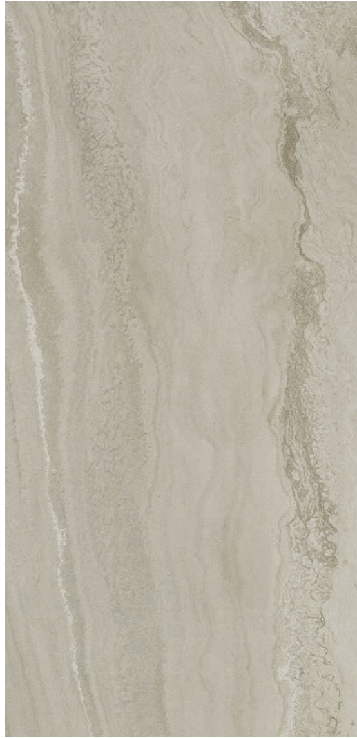
60 x 120 cm (24 x 48) Matte Finish OV.SH.GRY.2448.MT