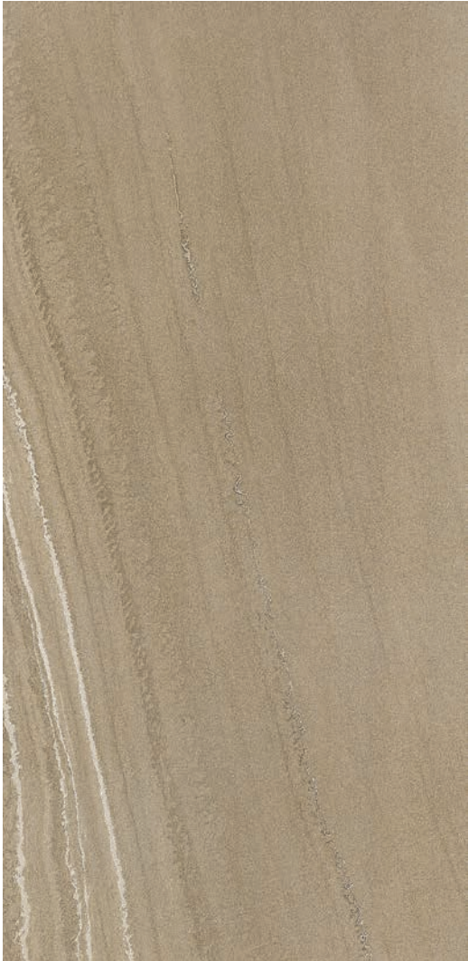
60 x 120 cm (24 x 48) Matte Finish OV.SH.TPE.2448.MT