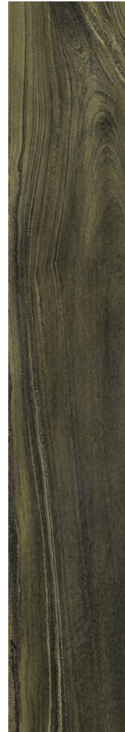
20 x 120 cm (8 x 48) Matte Finish OV.SH.BWN.0848.MT.OS