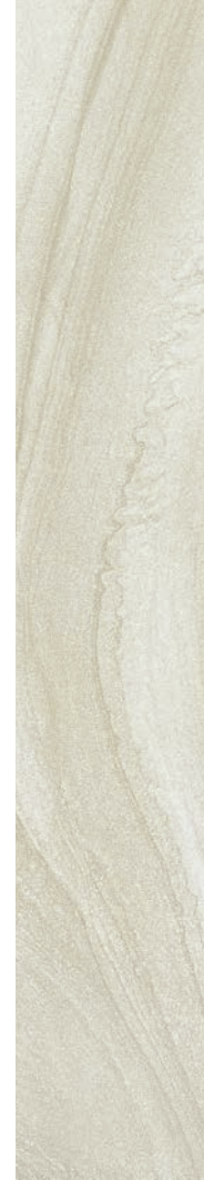
20 x 120 cm (8 x 48) Matte Finish OV.SH.WHT.0848.MT.OS