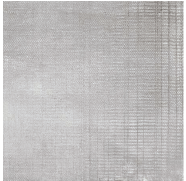
60 x 60 cm (24 x 24) GA.OR.SMK.2424

All items shown in this document are part of Olympia's stocking program. For special orders, please contact your Olympia Tile Sales Representative.