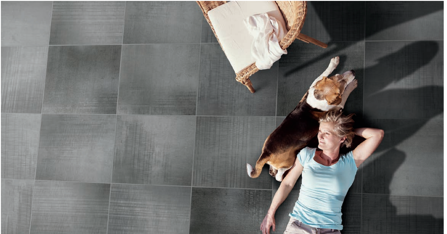
DARK (Dark Grey)