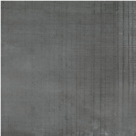
60 x 60 cm (24 x 24) GA.OR.DRK.2424

All items shown in this document are part of Olympia's stocking program. For special orders, please contact your Olympia Tile Sales Representative.