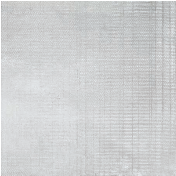
60 x 60 cm (24 x 24) GA.OR.ICE.2424