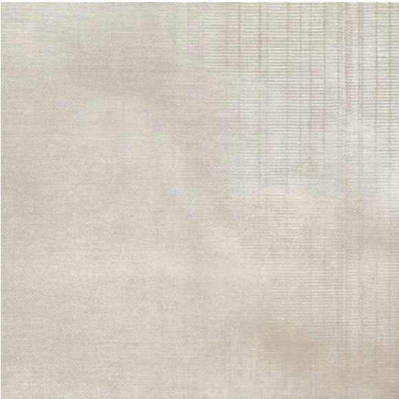
60 x 60 cm (24 x 24) GA.OR.SND.2424