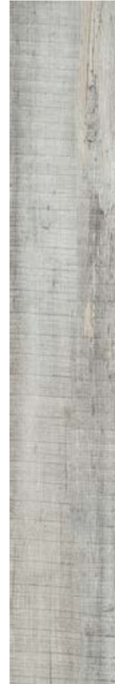
8" x 48" Matte KM.NN.EMB.0848.MT