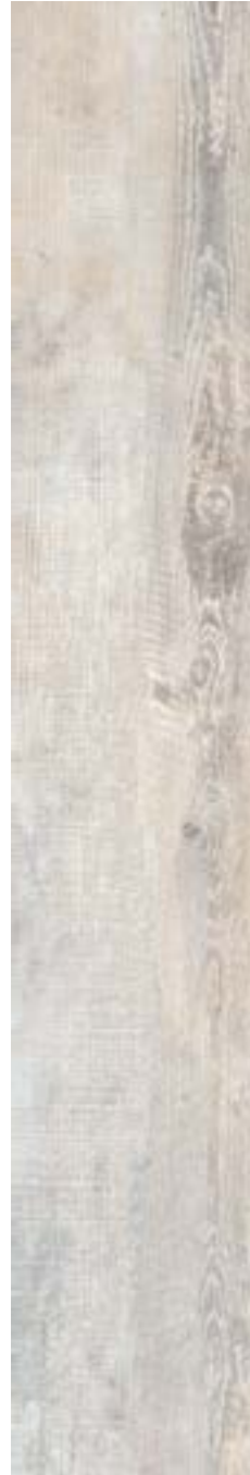
8" x 48" Matte KM.NN.DAY.0848.MT