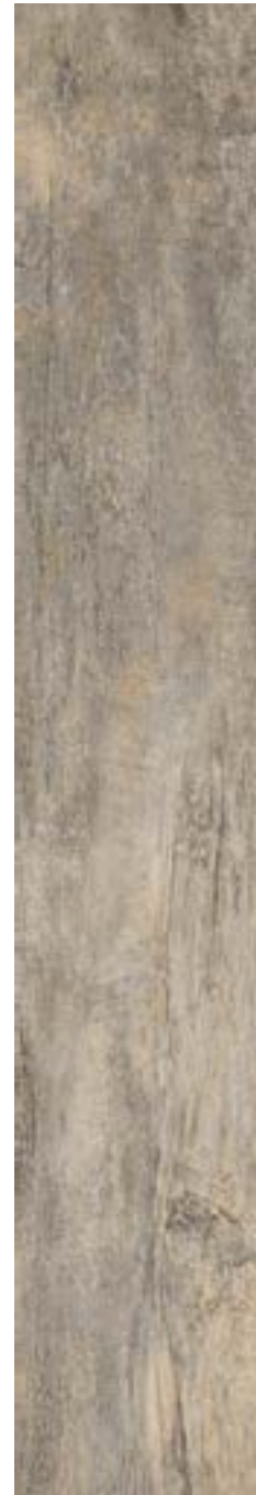
8" x 48" Matte KM.NN.HNY.0848.MT