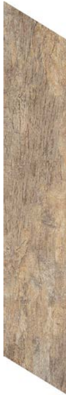
8" x 48" Chevron - Matte KM.NN.HNY.0848.CHEV

All items shown in this document are part of Olympia's stocking program. For special orders, please contact your Olympia Tile Sales Representative.