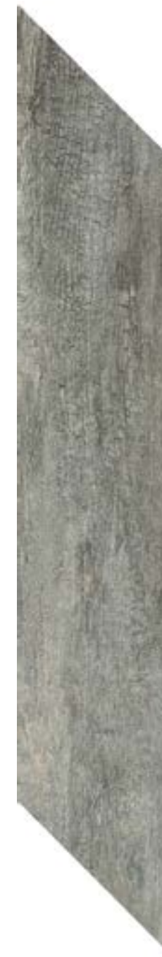
8" x 48" Chevron - Matte KM.NN.EMB.0848.CHEV

All items shown in this document are part of Olympia's stocking program. For special orders, please contact your Olympia Tile Sales Representative.