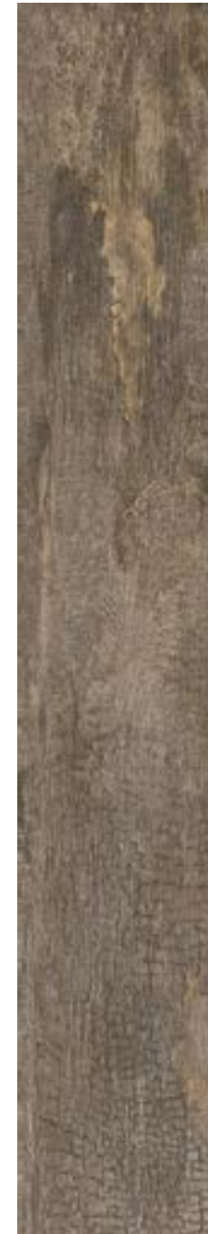
8" x 48" Matte KM.NN.BNT.0848.MT