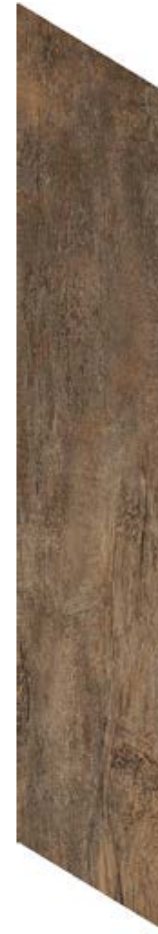
8" x 48" Chevron - Matte KM.NN.BNT.0848.CHEV

All items shown in this document are part of Olympia's stocking program. For special orders, please contact your Olympia Tile Sales Representative.