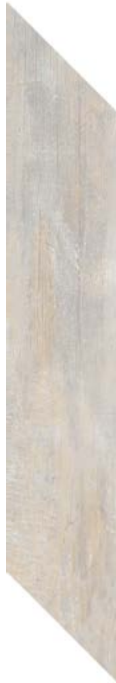
8" x 48" Chevron - Matte KM.NN.DAY.0848.CHEV