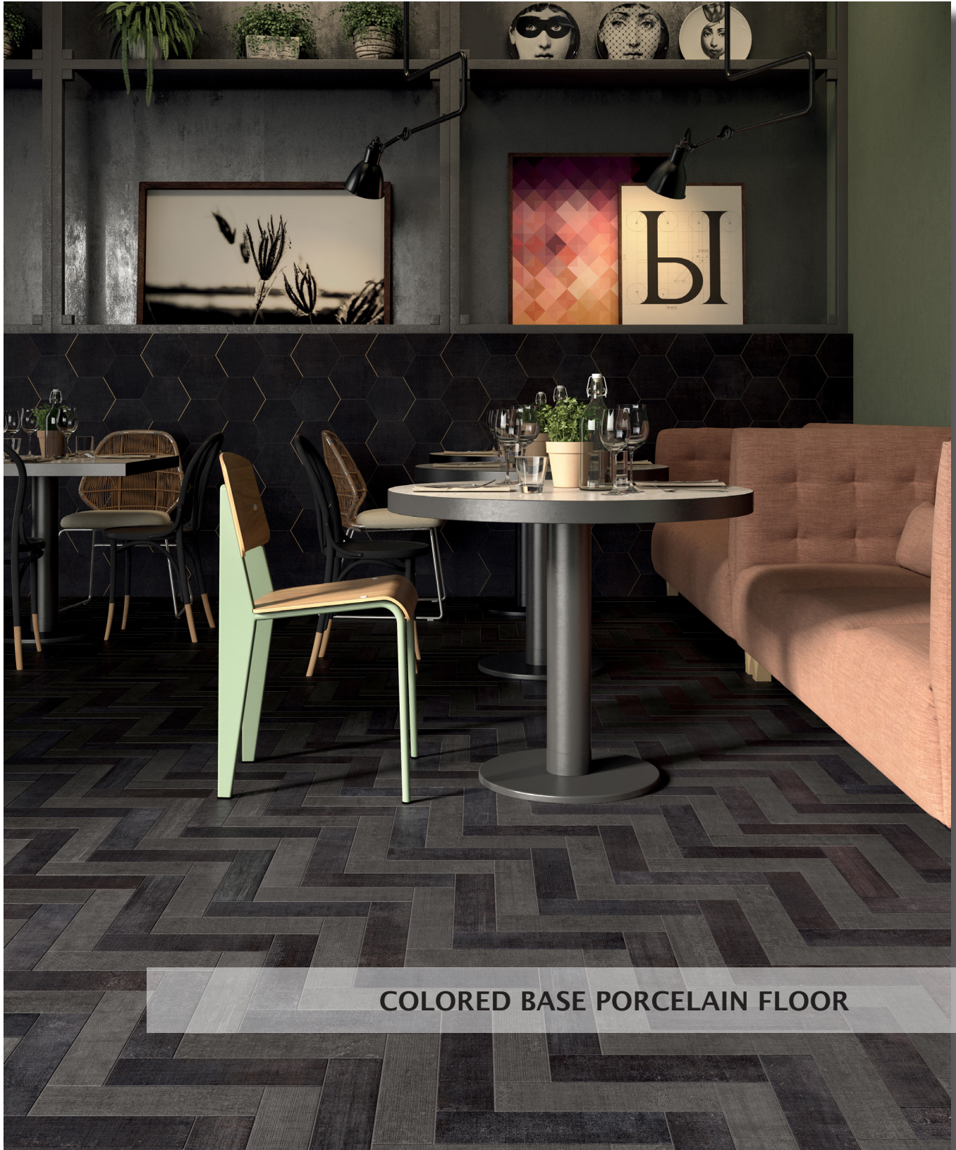
COLORED BASE PORCELAIN FLOOR

Weaving contemporary style with the simplistic and timeless appeal of woven fabrics and concrete. Subtle textures and a classic palette, Merino incorporates a fresh air of modernity with the traditional hexagon and plank formats.