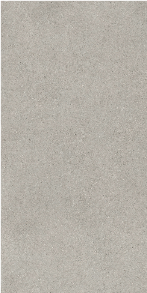
30 x 60 cm (12 x 24) Matte Finish WA.KN.PRL.1224.MT