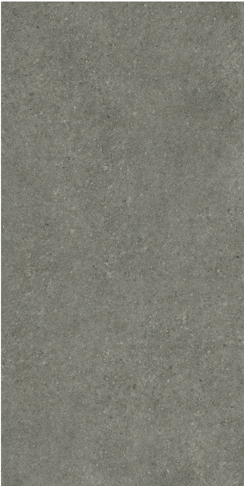
30 x 60 cm (12 x 24) Matte Finish WA.KN.GRY.1224.MT

All items shown in this document are part of Olympia's stocking program. For special orders, please contact your Olympia Tile Sales Representative.