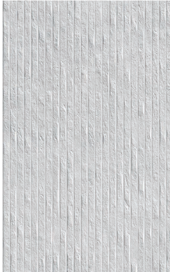
25 x 40 cm (10" x 16") Brick Relief Decor GE.GN.LGR.1016.MT.DC