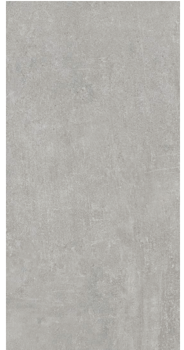
30 x 60 cm (12" x 24") GE.GN.GRY.1224.MT

All items shown in this document are part of Olympia's stocking program. For special orders, please contact your Olympia Tile Sales Representative.