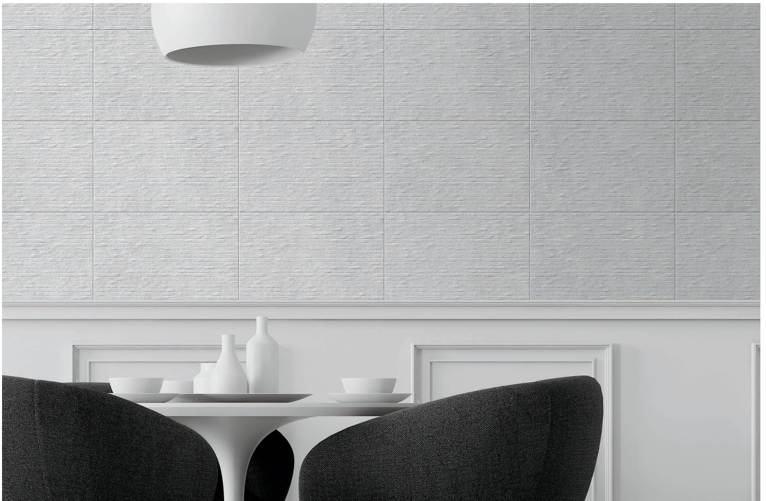
WHITE 10" x 16" Matte Decor