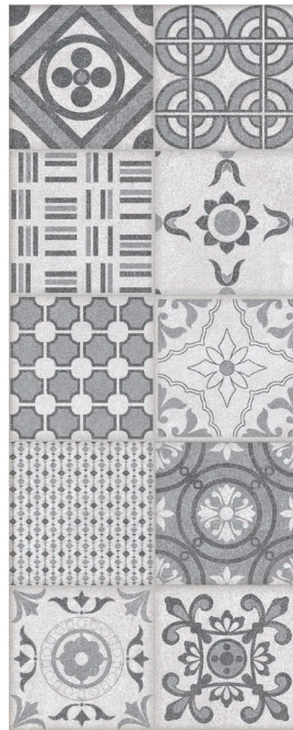
GREY PATCHWORK DECOR 20 x 50 cm (8" x 20") GE.GN.GRY.0820.MT.DC

All items shown in this document are part of Olympia's stocking program. For special orders, please contact your Olympia Tile Sales Representative.