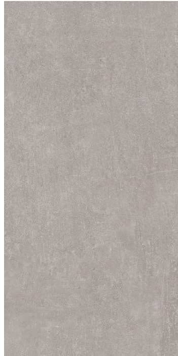
30 x 60 cm (12" x 24") GE.GN.TPE.1224.MT