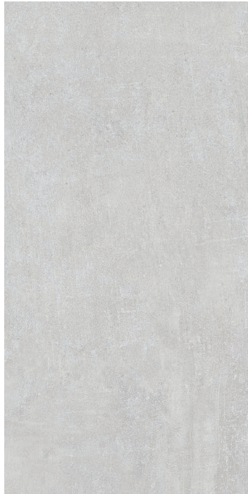
30 x 60 cm (12" x 24") GE.GN.LGR.1224.MT