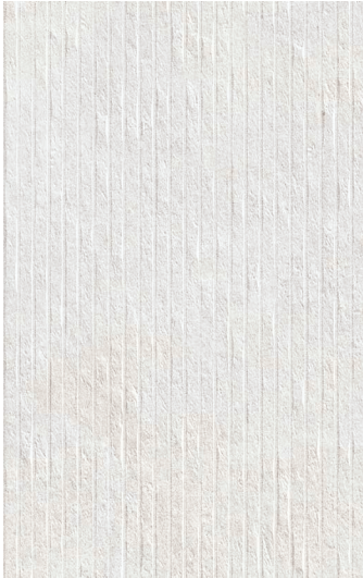
25 x 40 cm (10" x 16") Brick Relief Decor GE.GN.WHT.1016.MT.DC