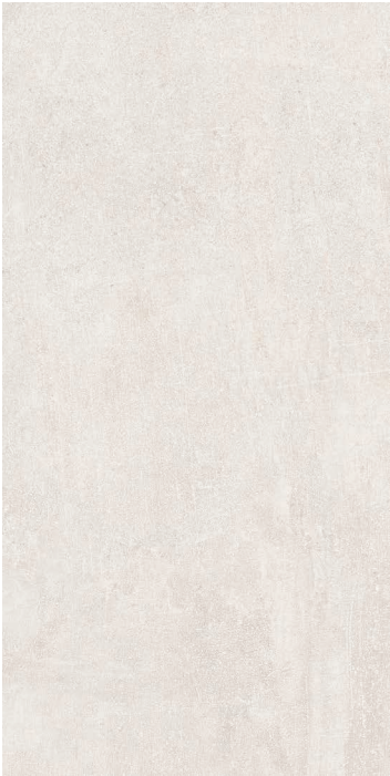
30 x 60 cm (12" x 24") GE.GN.WHT.1224.MT