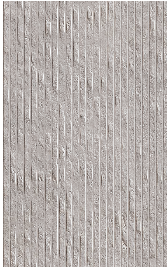
25 x 40 cm (10" x 16") Brick Relief Decor GE.GN.TPE.1016.MT.DC