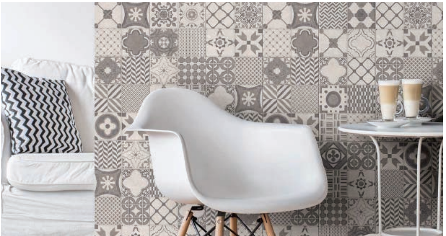
TAUPE 8" x 20" Matte Decor