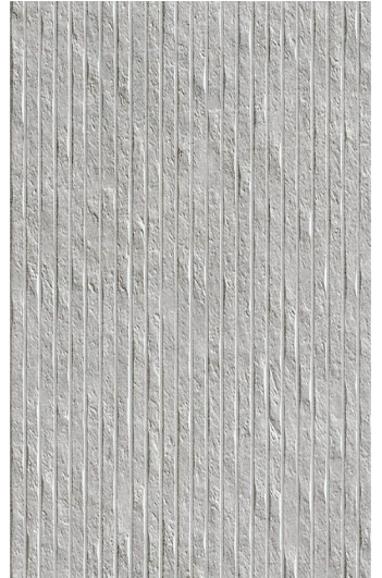
25 x 40 cm (10" x 16") Brick Relief Decor GE.GN.GRY.1016.MT.DC