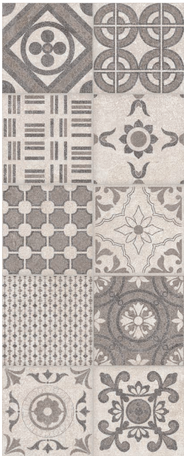
TAUPE PATCHWORK DECOR 20 x 50 cm (8" x 20") GE.GN.TPE.0820.MT.DC