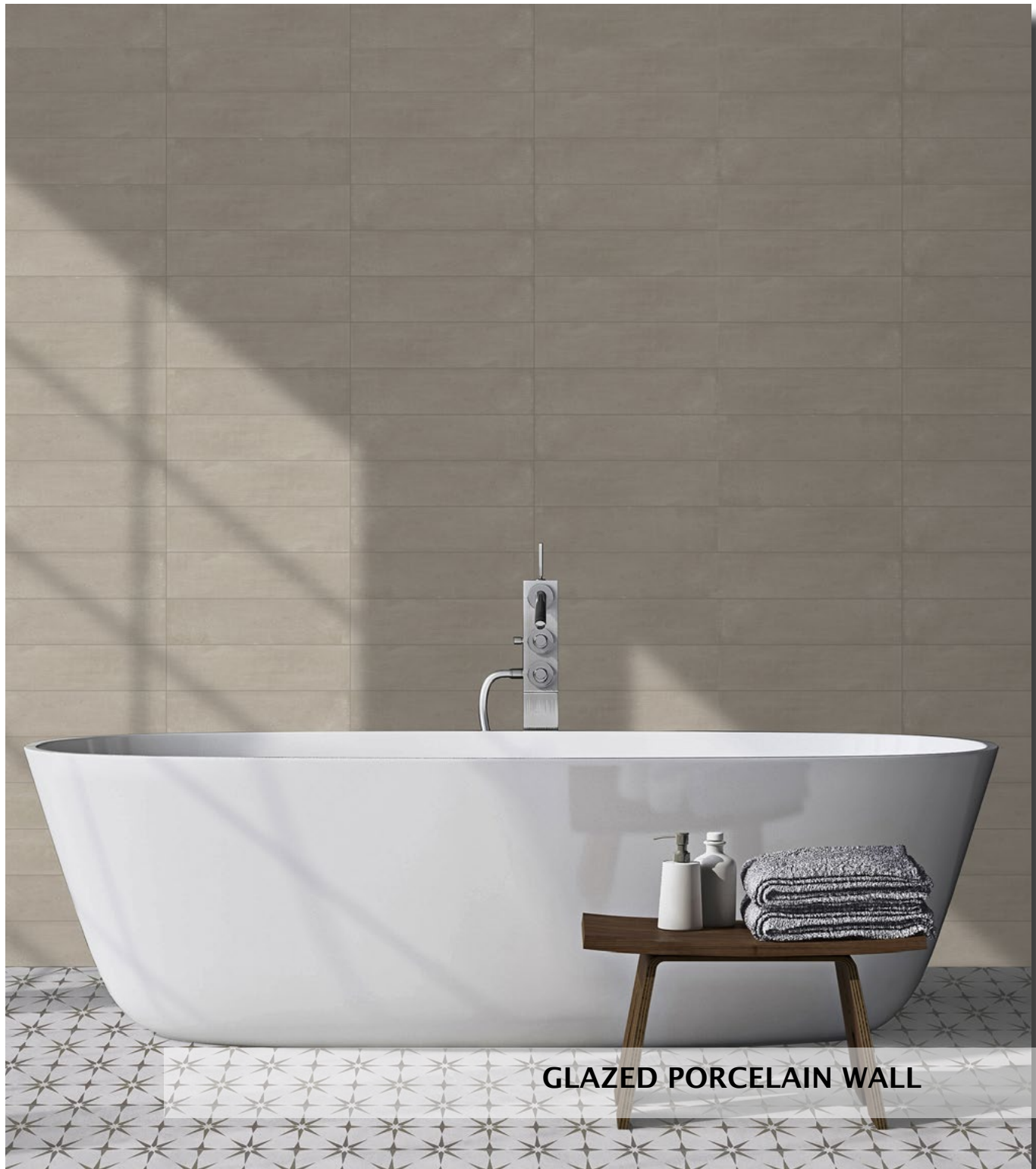
GLAZED PORCELAIN WALL

A beautiful collection of wall tiles in 5 contemporary colors. The slightly undulated finish surrounded by a thin border gives this tile a unique 3D effect.