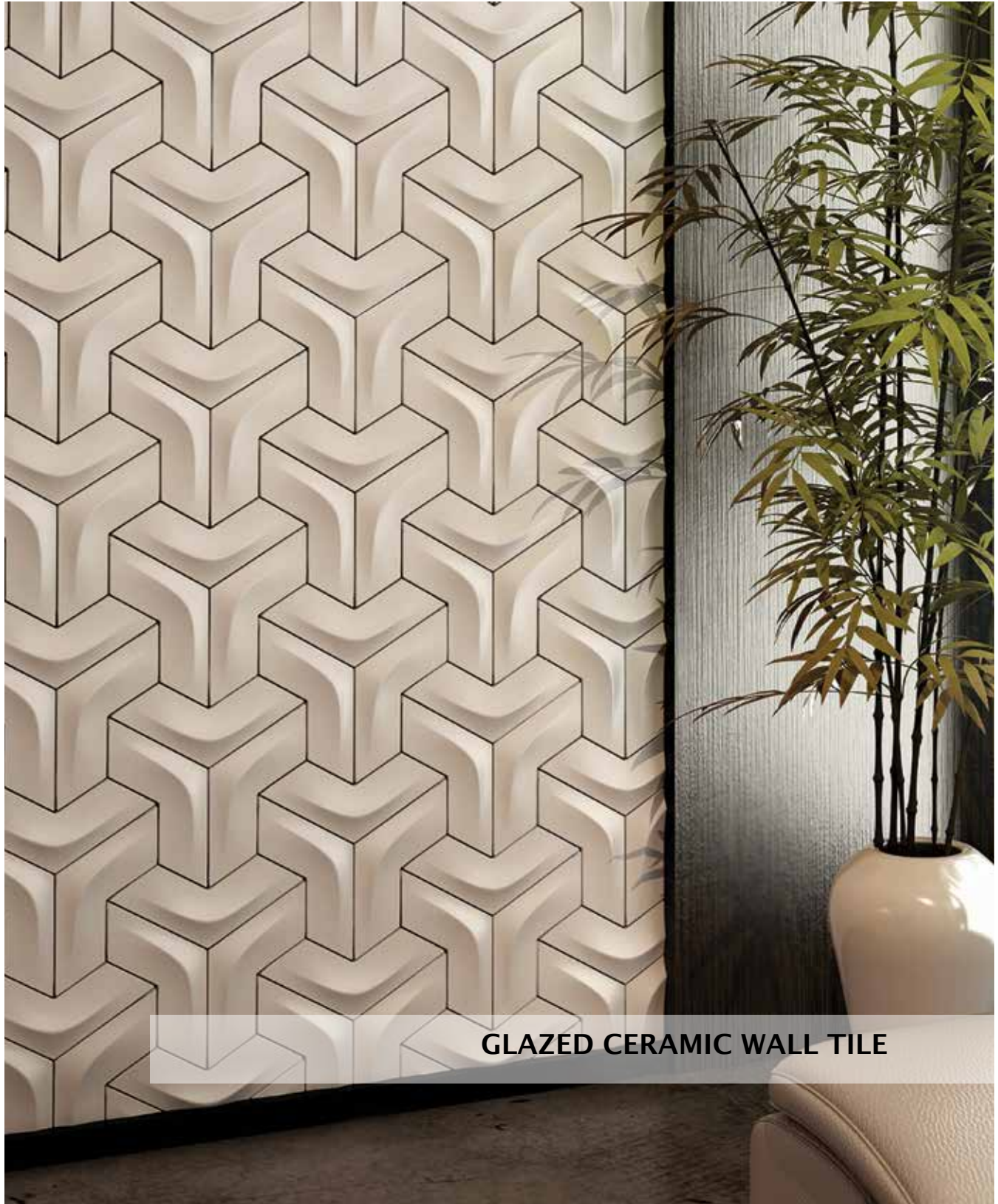
GLAZED CERAMIC WALL TILE

A unique wall tile offers a three-dimensional raised surface in an arc shape. This series allows for a variety of playful designs due to the shape of the tile. Perfect for spaces where a dramatic statement is de rigueur.